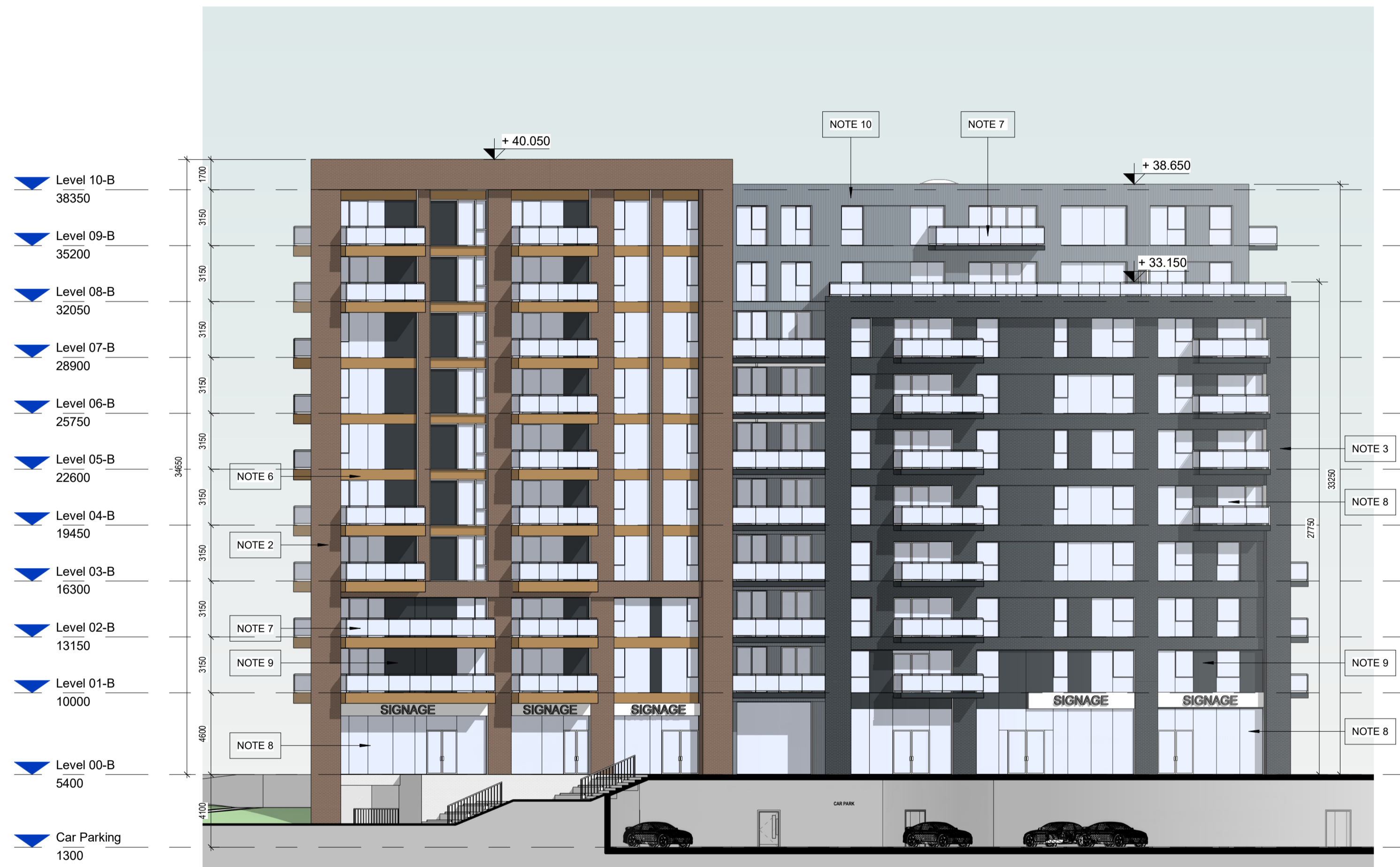
1 BLOCK B-SOUTH ELEVATION